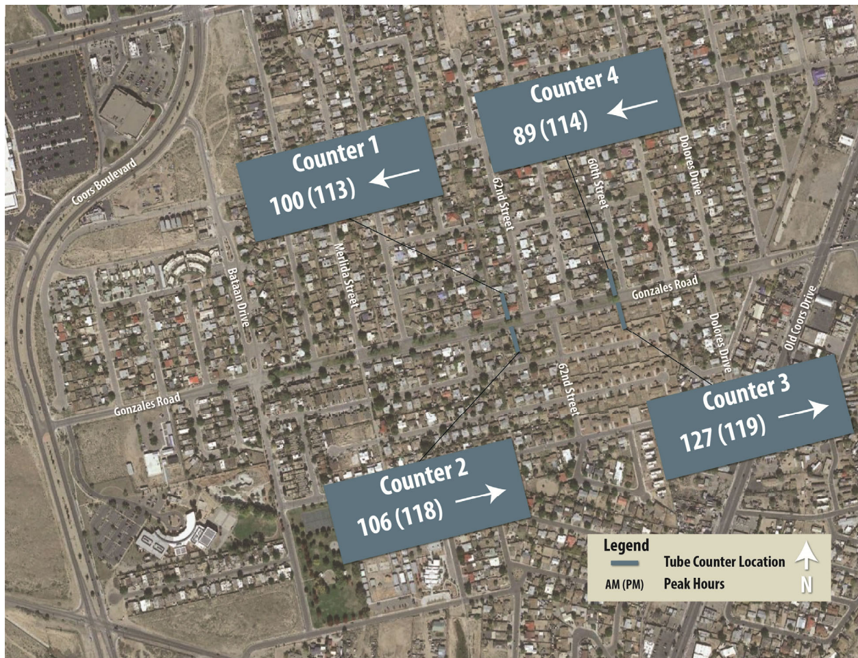
Figure 1: Project Area and Existing Traffic Volumes

The Gonzales Road project is located in Albuquerque, New Mexico and is a two-lane, divided major collector that runs east-west between Coors Boulevard and Old Coors Drive. 60 th Street is a two-lane, undivided local street that runs north-south and intersects the east end of Gonzales Road at a T-intersection. 62 nd Street is a two-lane, undivided local street that runs north-south and intersects the west end of Gonzales Road at a T-intersection. See Figure 1 for a map of the project area.