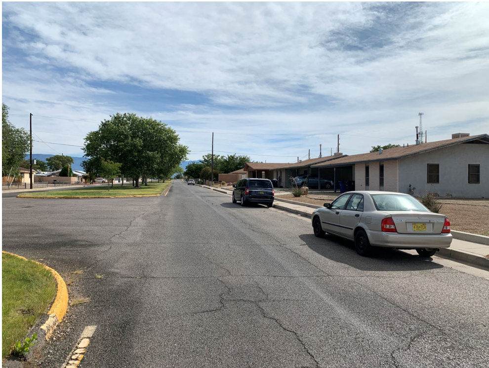
Figure 3: Gonzales Road looking east