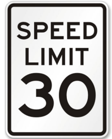
Figure 2: Gonzales Road Speed Limit

Gonzales Road is an 86-ft wide roadway with a 40-ft wide median, curb and gutter, and 4-ft wide sidewalks. See Figure 3 and Figure 4 for photos of the existing roadway, and Figure 5 for the existing Gonzales Road typical section.