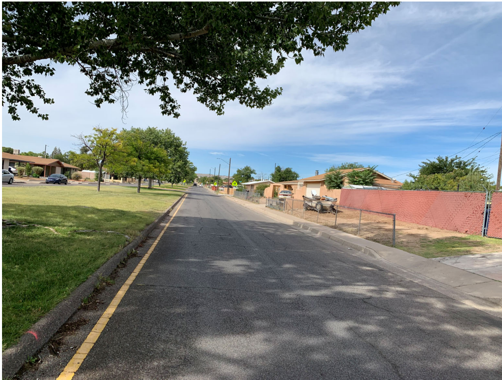
Figure 4: Gonzales Road looking west